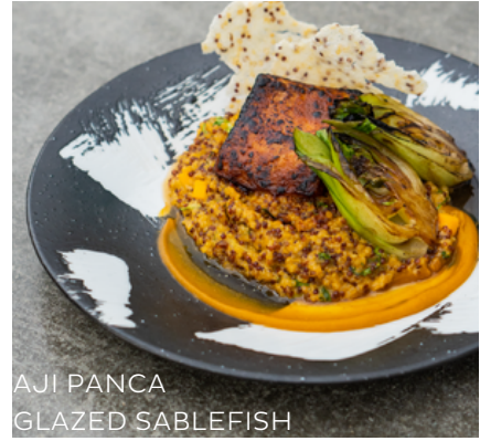
AJI PANCA GLAZED SABLEFISH