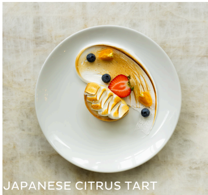
JAPANESE CITRUS TART