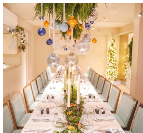
DECOR NOT INCLUDED